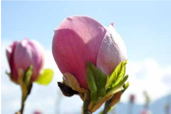
Magnolia 'Cameo' shows off reddish purple flowers at an early age.