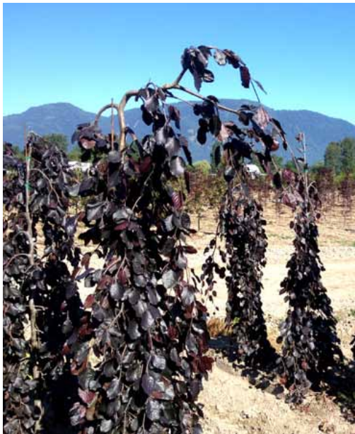
Branches flowing like a fountain makes Fagus s. 'Purple Fountain' a true focal point of the garden.

A columnar tree with deep purple leaves which will reach 70 feet tall by 15 feet wide. More open growth habit than 'Dawyck Gold'. Excels in well-drained soil. Can be pruned to form a dense hedge. Zone 4-7. B&B