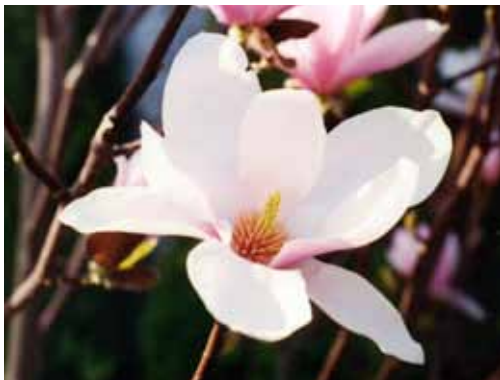
Magnolia 'Coates', one of our favorite soulangia type magnolias with a spectacular spring display.

Salmon-pink flowers that are 10 inches in diameter make a grand display. This plant flowers (in great profusion) in late March to early April and has an upright growth habit to