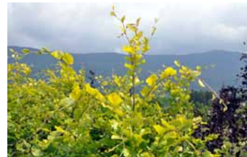
Fagus syl. 'Dawyck Gold' with new yellow leaves.

A cross between 'Dawyck' and 'Zlatia', this tree has a narrow colum-