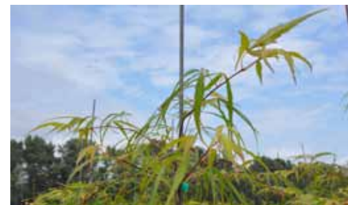
Delicate green leaves of Acer palmatum 'Koto-no-ito' give the plant a lacy look. Green bark looks great in winter.

Considered the best for autumn coloration, this large-leaved cultivar puts on a dazzling performance. The green leaves turn intense brilliant crimson becoming fluorescent red when the sun hits the tree. This show may continue for several weeks, depending on the weather. Grows to 10-15'. Zone 6-8. B&B, G