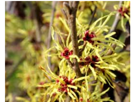
Lemon yellow flowers of Hamamelis mollis 'Sunburst' literally glow in the late winter sun.

Lemon yellow flowers literally glow in the late winter sun. One of the last to bloom. Abundant, scentless flowers make this small tree to 15 feet a winter jewel. Upright-spreading and loosely branched if not pruned. Zone 5-8. G