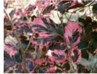
Fagus syl. 'Roseomarginata' with tri-color leaves.

B&B = BALLED & BURLAPPED G = GALLON CONTAINER