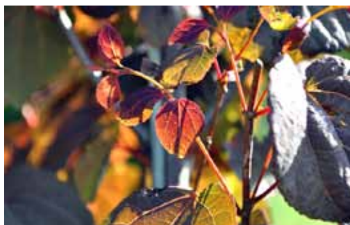
Cercidiphyllum japonicum fills the color palette changing from reddish purple to bluish green and finally to yellow apricot.

Early leafing tree with reddish-purple spring color gradually changing to a bluish-green in summer. Yellow to apricot fall color by mid-October. Colors best in acidic