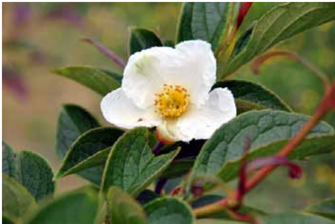
Stewartia pseudocamellia with white flowers in June.

Commonly known as Persian Ironwood, Parrotia persica is native to Iran (formerly Persia). It is a member of the witch hazels, putting on a great flower display in February when little else is blooming. The small red blossoms appear in great profusion making for a spectacular show. With age, the bark begins to exfoliate revealing a mosaic of color: green, gray, white and brown. Plant in full sun to achieve best fall color. May grow 40' tall by 30' wide. Zone 4-8. Limited quantities. B&B