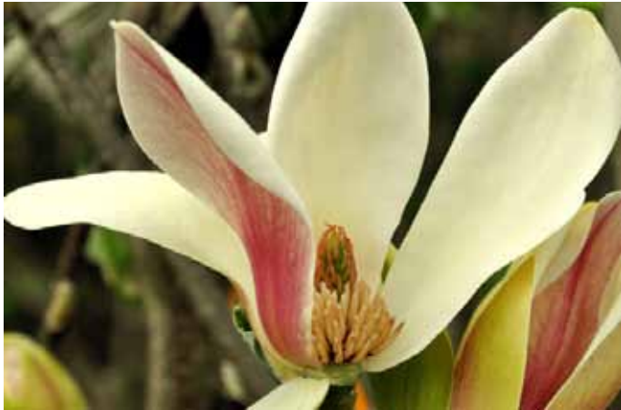
Magnolia 'Sunsation' has yellow blooms with a rose-pink base.