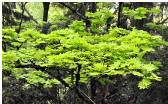
Acer shirasawanum 'Aureum' with medium green leaves in summer puts on a spectacular fall show going through orange to red.

An all-season specimen plant commonly known as the Three-Flowered