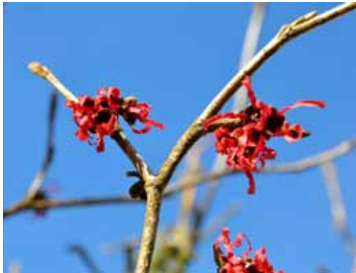
'Diane' is possibly the best red-flowering Hamamelis available. Somewhat fragrant too.

Upright growing shrub with orange-red flowers appearing January to March before the leaves emerge. Each flower has four crinkled, curled petals that are about 1 inch long. Typically reaches 12 feet at maturity. Excellent winter interest, but nice fall color too. Zone 5-8. G