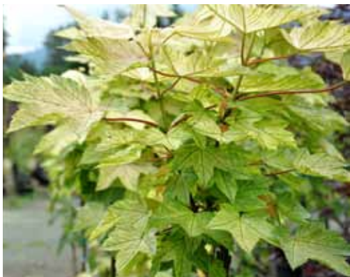
If you love variety, you will love the changing colors of Acer pseudoplatanus 'Brilliantissimum'