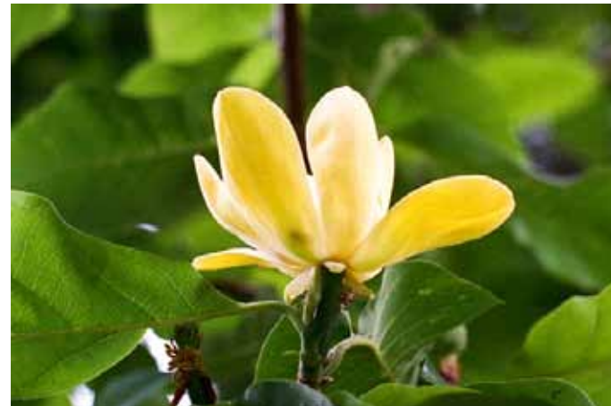
Magnolia 'Yellow Bird' has terrific color and excellent hardiness.

M. ACUMINATA x (M. x BROOKLYNENSIS 'EVAMARIA') Enjoy 2-3 weeks of flowers with this upright, hardy magnolia. A terrific yellow-flowered selection which blooms as the leaves emerge. Its yellow flowers have a slight tinge of green at the base of the outer tepals. Excellent color and consistency of bloom. Quite possible to have a second set of flowers in fall. Eventually reaches 40'. Zone 4-8. B&B, G