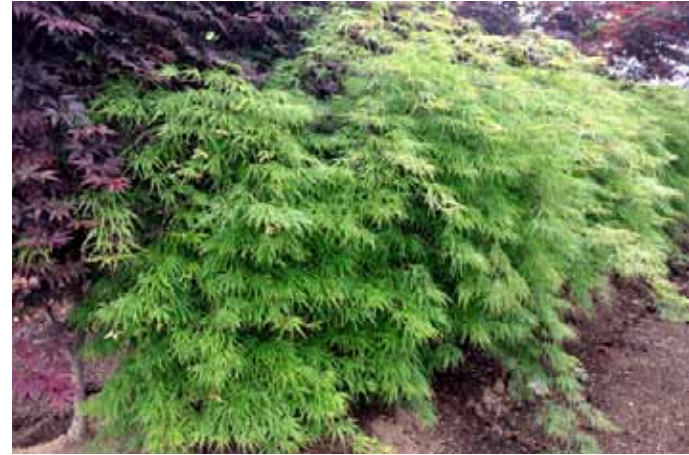
Acer palmatum dissectum 'Waterfall' with cascading branches.

B&B = BALLED & BURLAPPED G = GALLON CONTAINER