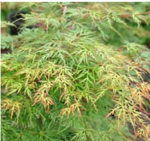
Acer palmatum dissectum 'Emerald Lace' with green summer leaves turning red in fall.

A unique cultivar from the Trompenburg Arboretum in Holland. The deep purple leaf lobes are slightly rolled under creating a most attractive effect. Leaves turn crimson in fall. Habit is upright, growing moderately fast to 20 feet. Zone 5-6. G