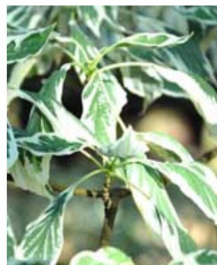
Cornus alternifolia 'Argentea' looks structurally like a Chinese Pagoda. Nice white edging around the green leaves. Hardier than Cornus controversa .

lowed by reddish foliage. Grows well in sun or partial shade. Autumn foliage is bright red with red berries. Matures to 20'. Zone 5-9. B&B, G