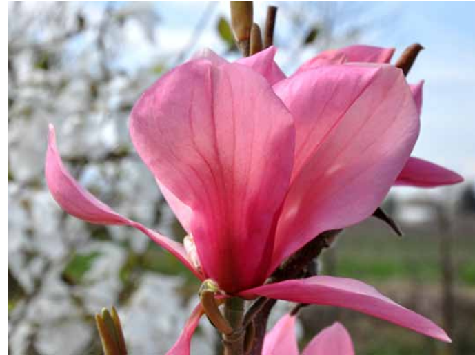
Magnolia 'Blushing Belle' with large pink flowers. Excellent hardiness ensures beautiful buds year after year.