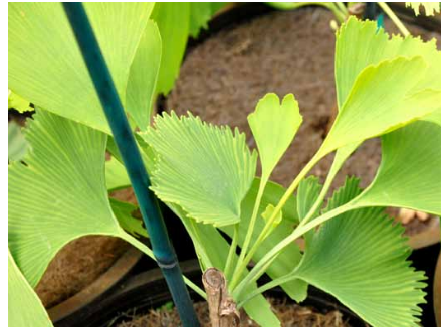
Ginkgo biloba 'Saratoga' in a 1 gallon pot. Dense canopy makes a great shade tree.

A shrubby plant with dense green foliage that resembles half open fans which was introduced by the Saratoga Research Institute in the 1950's. Rich yellow autumn color stands in contrast to other green landscape. Will reach 40' with a broad canopy—excellent for an urban shade tree. Handles sun or shade. Zone 4-8. B&B