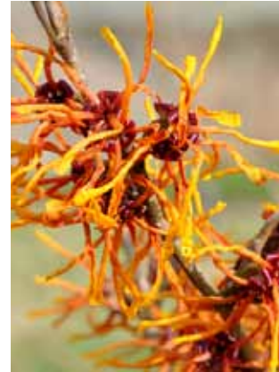
Late winter orange red flowers of Hamamelis 'Aphrodite'

A superb clone producing large 1" flowers. Each petal is red toward the base, orange in the middle and yellow at the tip making for a copper-