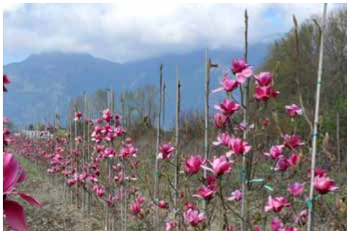
Brilliant ruby-red flowers of Magnolia 'Vulcan'.

(M. x BROOKLYNENSIS 'WOODSMAN') x M. 'GOLD STAR' Upright, fast growing tree with deep canary-yellow flowers (6 inches in diameter) which open just as the leaves emerge. Narrow petals of the flower cause this tree to appear to be covered with candle flames. Very