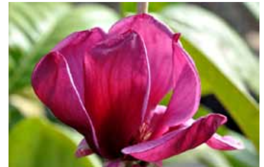
Dark red flower of Magnolia 'Genie'. A hybrid from New Zealand.

Dark red-purple buds open to a lighter shade of reddish-purple flowers. Inside flower color is a light rose-purple. Slightly fragrant. Very hardy. Pyramidal tree reaching 25' after 25 years. Zone 5-8. B&B, G