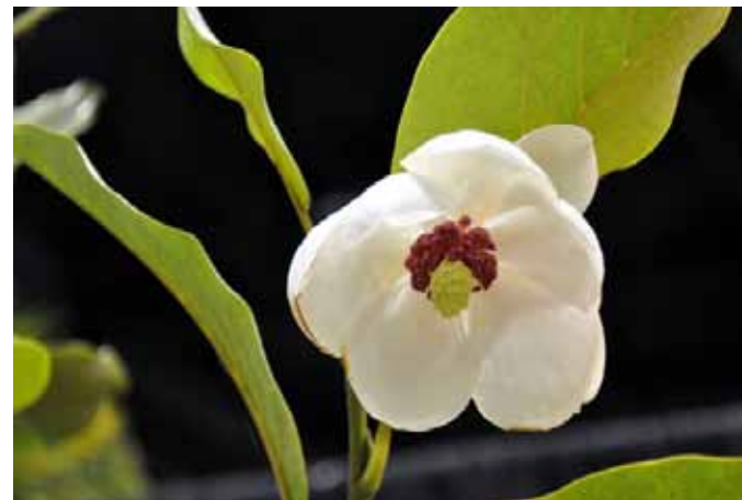
White flowers of Magnolia sieboldii 'Colossus' are pendulous.

to year with warmer night temperatures giving a richer pink. Grows to 15'. Zone 5-9. B&B, G