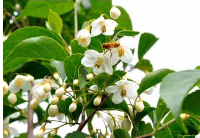
Clusters of white bell-shaped flowers of Styrix japonicus .

Slow growing narrow upright tree with a dramatic mix of autumn colors: golden yellow, orange pink, and scarlet. As the tree matures, exfoliating gray bark reveals white patches underneath—very showy in winter. Dense clusters of tiny flowers with bright red stamens appear early spring before the leaves emerge. Wavy oval leaves unfurl reddish purple, then mature to a lustrous dark green. Drought tolerant and adaptable to different soils. Great for a smaller yard, it grows to 25 feet by 15 feet at maturity. Zone 4-8. B&B