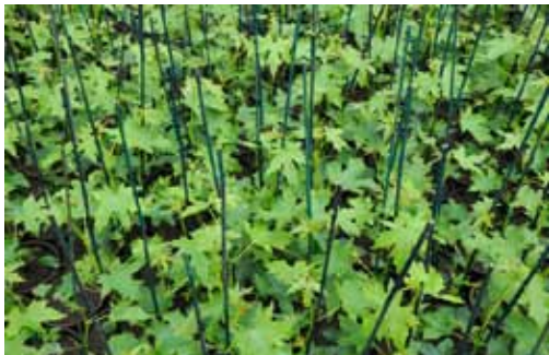
Deep glossy leaves of Liquidambar styraciflua 'Worplesdon' turn apricot-orange in fall.

A vigorous small plant with year round appeal. Fragrant creamy white flowers appear in late summer followed by purplish-red fruits that last into late fall. Tan bark exfoliates to reveal an attractive chocolate brown inner bark providing winter interest. Can be used either as a lawn specimen, or as a focal point around the home. Grows to about 20 feet upon maturity. Zone 6-9. B&B