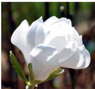
Magnolia x loebneri 'Donna', one of the best white star magnolias.