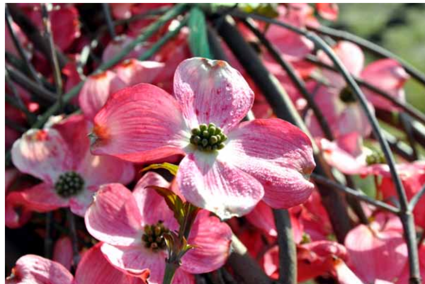
Cornus florida 'Rubra' starts its show with pink flowers, followed by reddish foliage.

Cornus florida 'Rubra' This long-time favorite has pink flowers blossoming in spring, fol-