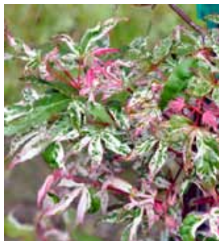
The variegated new growth of Acer palmatum 'Higasayama' is simply stunning.

Glossy-leaved 5-lobed cultivar boasting green leaves in summer and magnificent orange in fall. A variety found in Mt. Lehman, BC and named by Reimer's. Grows to 15 feet. Zone 6-8. B&B, G