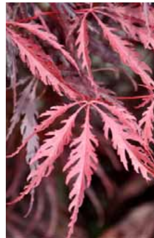
Leaves of Acer palmatum dissectum 'Tamukeyama' have excellent heat tolerance.

Finely dissected leaves of this selection have a flowing appearance as they cascade down the outside of the mature plants. Foliage is bright green, withstands full sun, and turns to brilliant golden with crimson streaks in fall. Matures to 8' high by 10' wide. Zone 5-9. G