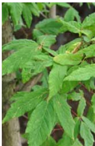
Acer triflorum a.k.a. "The Three Flowered Maple" has year round appeal.