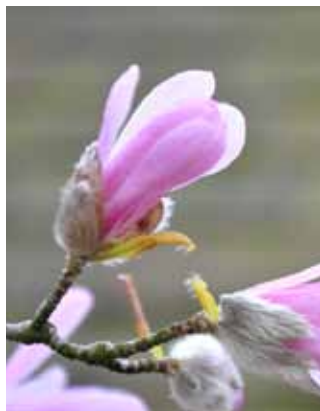
Magnolia 'Leonard Messel' is a stellata type with pink flowers.

Large upright hybrid shrub with fragrant lilac-pink star-shaped flowers. Flowers appear to be quite frost resistant. Color can vary from year