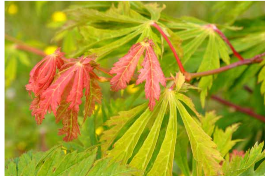
Brilliant scarlet fall coloration of Acer japonicum 'Aconitifolium'.

Excellent red color that resists summer fading and vigorous arching habit make this one of our most popular