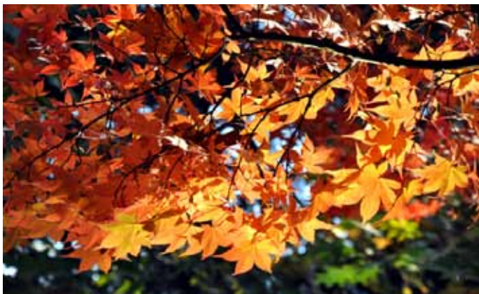
Acer p. 'Harvest Orange' has pumpkin colored leaves in fall.