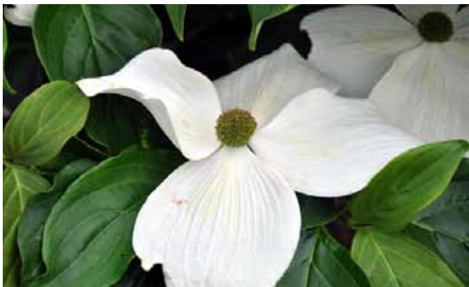
Large white flowers of Cornus kousa 'Starlight' on a densely branched tree