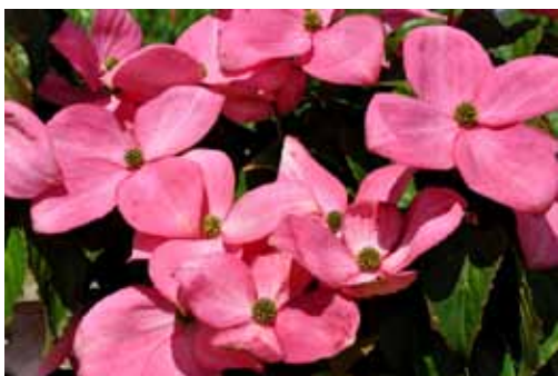
Beautiful pink-red bracts of Cornus k. 'Satomi'.

C. KOUSA x C. NUTTALLII A densely branched, upright tree bred at Rutgers University with the glossy leaves of