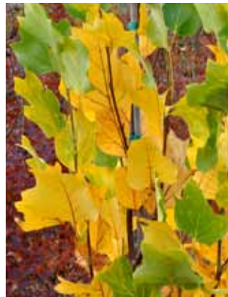
The blunt "maple leaf" of Liriodendron tulipifera 'Arnold'.

A columnar tree ideal where height is required and space is limited. Oddly shaped leaves resemble a blunt maple leaf but without the end lobe. Bright yellow-green leaves turn butter-yellow in fall. Tulip-shaped flowers appear in June/July and are yellowish-green with a bit of orange at the base. Excels in deep, moist soils. Avoid drought conditions. Can reach 60 feet high by 30' wide. Zone 4-9. B&B, G