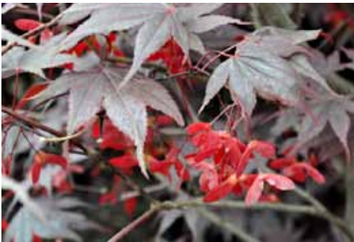
Acer palmatum 'Bloodgood' with very attractive red winged fruits.

Commonly known as the Paperbark Maple, this tree is ideal as a specimen tree because it truly is a four-season beauty. Olive-green leaves turn gold and red in autumn. Coppery colored peeling bark provides winter interest, especially when capped with snow. Grows to 25 feet. Zone 4-9. B&B, G